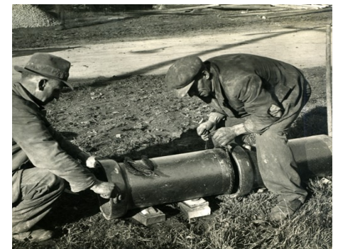
SETTING A NEW LATERAL.—1950's.